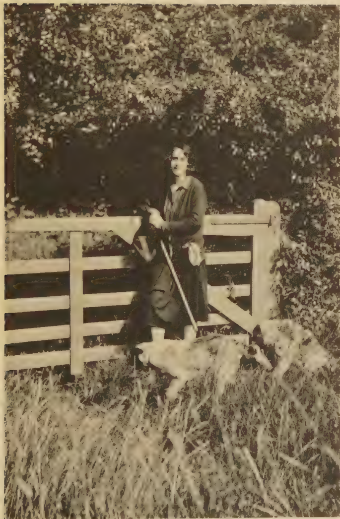
Orlando at the present time